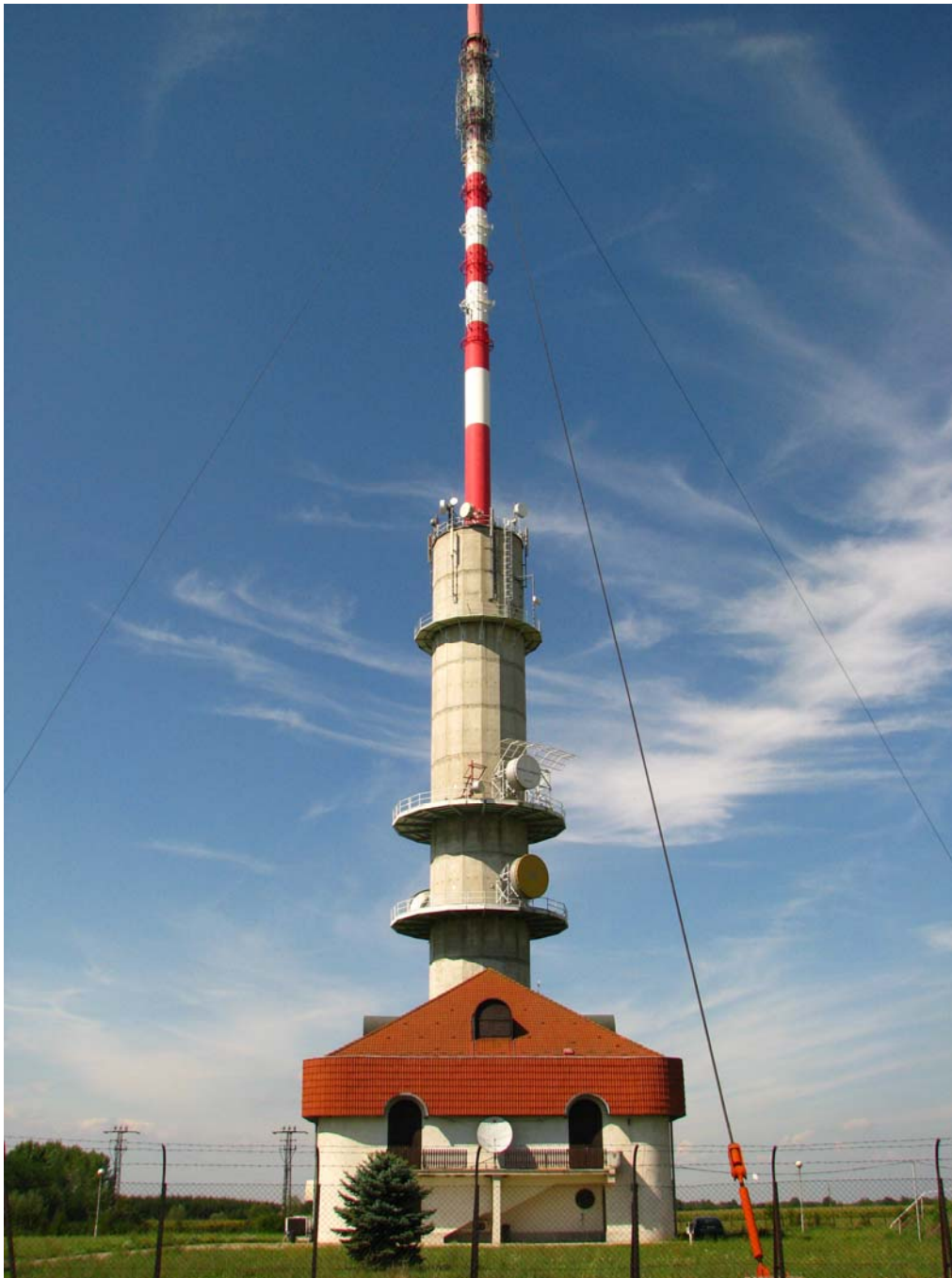
Figure 2: Tall flux tower near Hegyhátsál, Hungary .

greenhouse gases: The Hungarian Perspective”. Hopefully, this synthesis of tall tower and multi-site approach will result in improved methods for upscaling agricultural CO 2 fluxes using remote sensing based modeling.