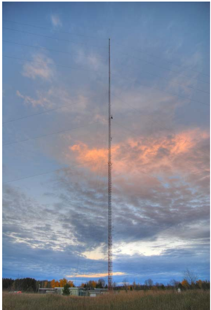
Figure 1. Tall tower.

—Examining the diurnal and seasonal covariances between carbon fluxes and boundary layer mixing depths (Yi et al. , 2004), and evaluating the impact of