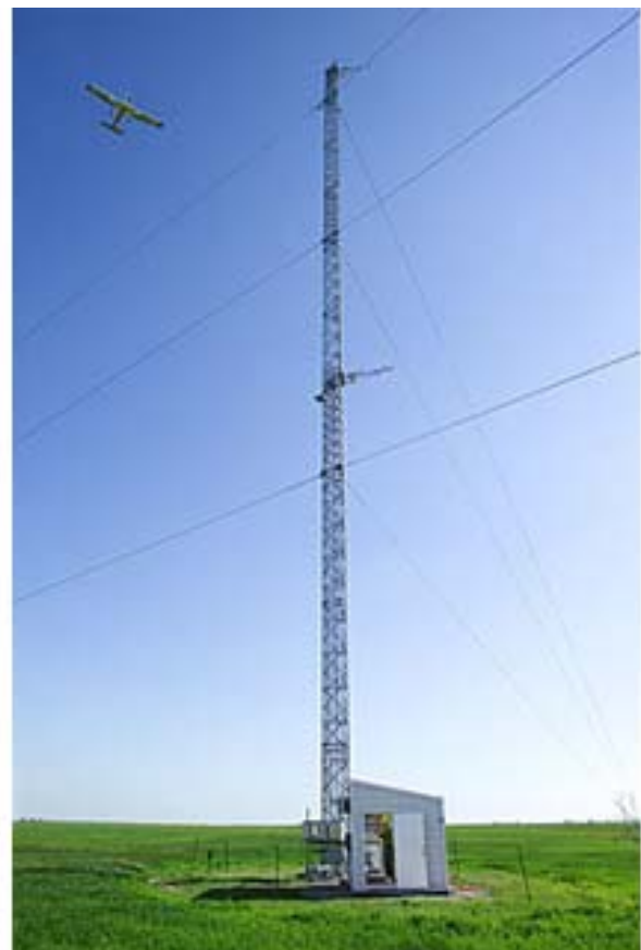
Figure 1. Tall tower

to develop into a reliable and robust methodology, and it is still far from perfect, even for ideal sites. Regional atmospheric inversions are more complex. Issues that have limited progress include uncertainty in the atmospheric transport fields used to construct the inversions, uncertainty regarding how to represent the mismatch between model grids and point mixing ratio observations, limited atmospheric mixing ratio data, uncertainty in the initial flux estimates used in the inversions, and uncertainty regarding how