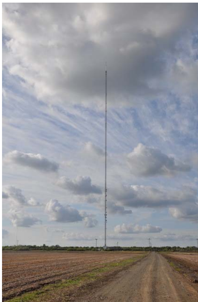
Figure 1. LBNL and NOAA instruments measure CH 4 , N 2 O, and other greenhouse gases at a 600 m tower near Walnut Grove, California.

The problem of estimating non-CO 2 GHG sources is similarly important and challenging because non-CO 2 greenhouse gases play a significant role in